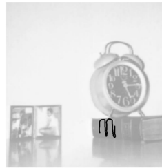
Fig. 1. Non Identifying Detection on a book edge. 10^{-3} -meaningful match.