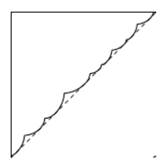
FIGURE 3. The map T.

If x \in W then T(x) \in W . Indeed, if T(x) \notin W , T(x) is a fixed point so T is constant on [x, T(x)] (T is non-decreasing). Let q be any rational number in (x, T(x)): T(x) = T(q) is then computable, but does not belong to W: impossible.